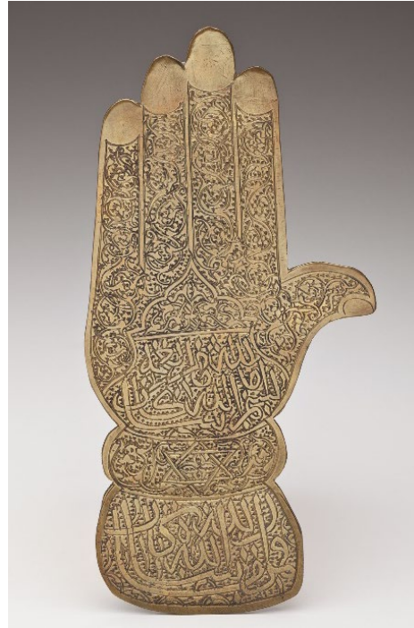
Left: Unknown, Wall Tile with Turquoise Saz Leaf, Blue Hyacinth and Sections of Red and Blue Palmettes, Iznik, Turkey, late 16th or early 17th century, Ottoman Period (1299–1922). Fritware polychrome painted over white slip under transparent glaze. Newark Museum Purchase. Right: Unknown, Inscribed in Thuluth Script, Hand of Fatima Charm with Six-Pointed Star, Algeria/Morocco, before 1928. Brass. Newark Museum Purchase.

PHOENIX (January 17, 2019) Phoenix Art Museum will present Wondrous Worlds: Art & Islam Through Time & Place , the first exhibition on art and Islam at the Museum in more than two decades, from January 26 through May 26, 2019 in the Art of Asia galleries. The comprehensive exhibition, organized by the Newark Museum, will feature more than 100 artworks, including handwritten texts, ceramics, textiles, jewelry, photographs, and paintings, from across centuries and from nearly every continent, with the exception of Antarctica. Unlike previous national and international exhibitions on the subject, Wondrous Worlds is organized around the Five Pillars of Islam instead of geography, time period, or material, offering a fresh perspective on the intersection of art and Islam.