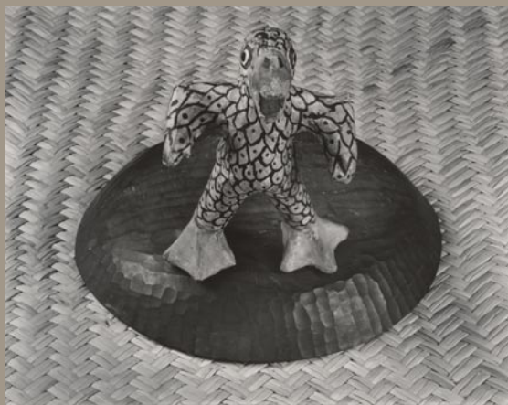
Juguetes, Penguin, 1926. Edward Weston Archive. 81.151.16.